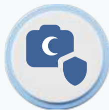
Medical Expenses (Due to Accident)

Up to RM1,000 (Exclude jewelleryes, laptop, notebook, camera, cash, iPad, handphone/smartphone)