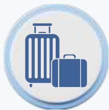
Loss or Damage of Personal Luggage

Up to RM1,000 (Exclude jewelleryes, laptop, notebook, camera, cash, iPad, handphone/smartphone)