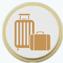
Loss or Damage of Personal Luggage

Up to RM500 (Exclude jewelleryes, laptop, notebook, camera, cash, iPad, handphone/smartphone)