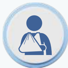
Accidental Death/ Permanent Disablement