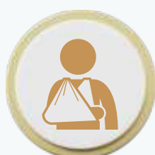
Accidental Death/ Permanent Disablement